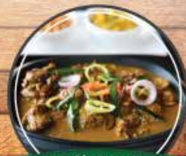
Exotic Mutton Curry