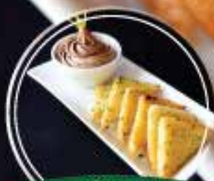
Liver Pate With Toast Rs.380/-