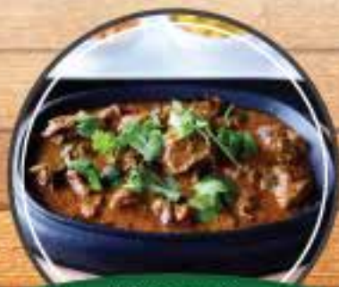
Beef Pepper Curry