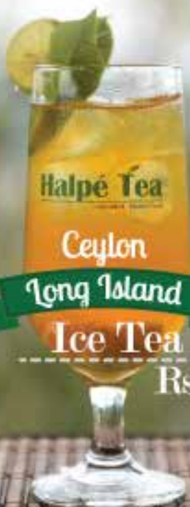
Ceylon Long Island Ice Tea