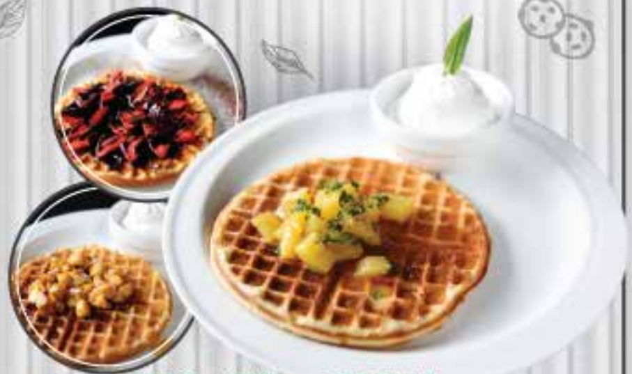
Waffles With Strawberry - Peach - Pineapple