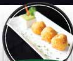
Prawn Balls With Green Apple & Mango Chutney Dip Rs.680/-