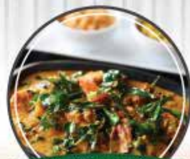
Jaffna Prawn Curry