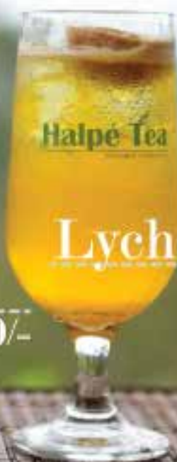
Passion Lychee Bomb