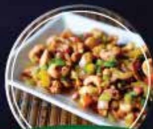
Masala Cashewnuts Rs.580/-