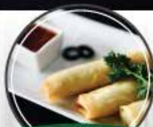
Assorted Mushroom Spring Rolls With Sweet Chili Dip Rs.480/-