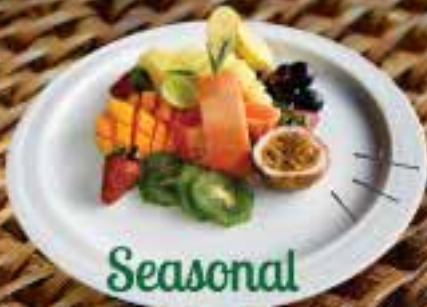
Seasonal Fruit Platter