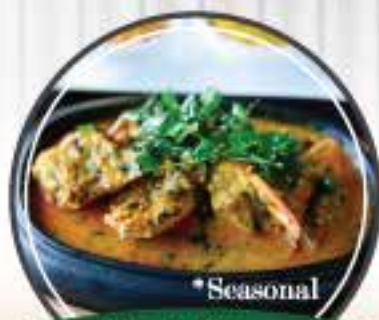
*Seasonal Crab Curry