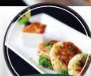
Crab Cakes With Coriander Dip Rs.980/-