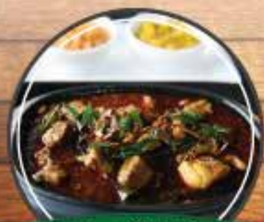
Gamboge Pork Curry