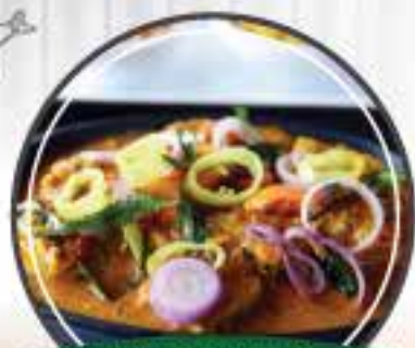
Fish Mustard Curry