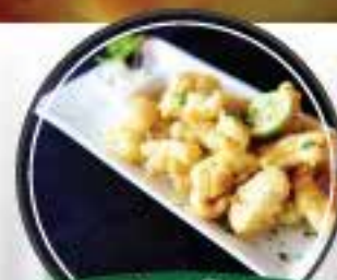
Batter-Fried Cuttlefish With Tartar Sauce Rs.980/-