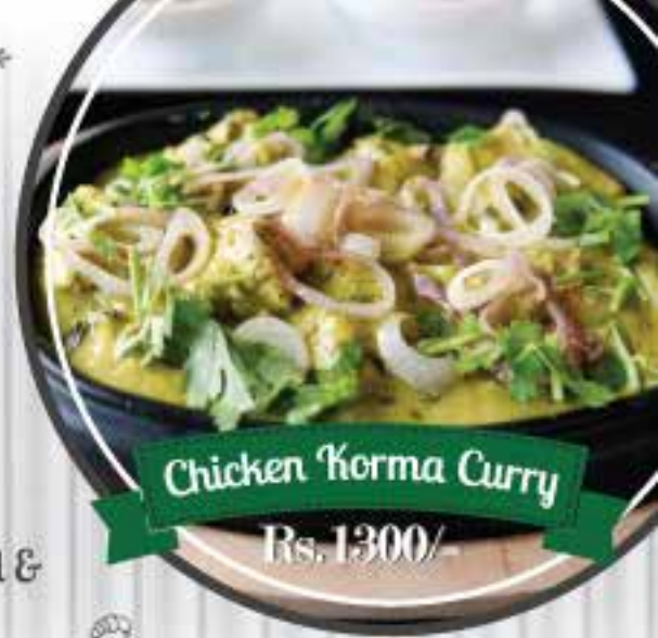
Chicken Korma Curry

Your Choice Of Traditional Sri Lankan Curries Served In Sizzling Platters With Toasted Bread Or Steamed Rice With Tempered Dhal & Pol Sambol